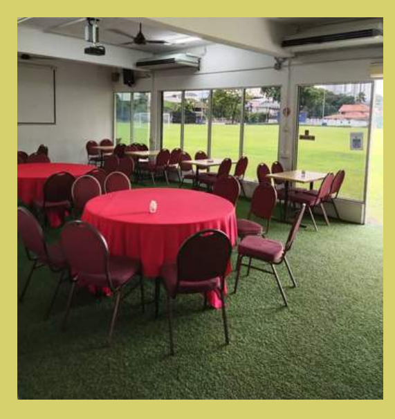
Birthdays | Corporate Events | Launches | Training | Re-Unions