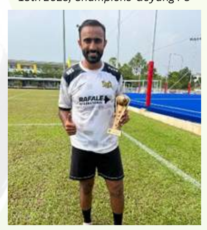
Jasmitt Bhullar Challenge Trophy 15th April 2023