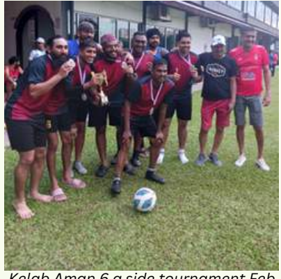
Kelab Aman 6 a side tournament Feb 18th 2023, Champions-Goyang FC

Cheers to all for the continuous support of sports and the nation! Majulah Sukan untuk Kelab Aman dan Negara