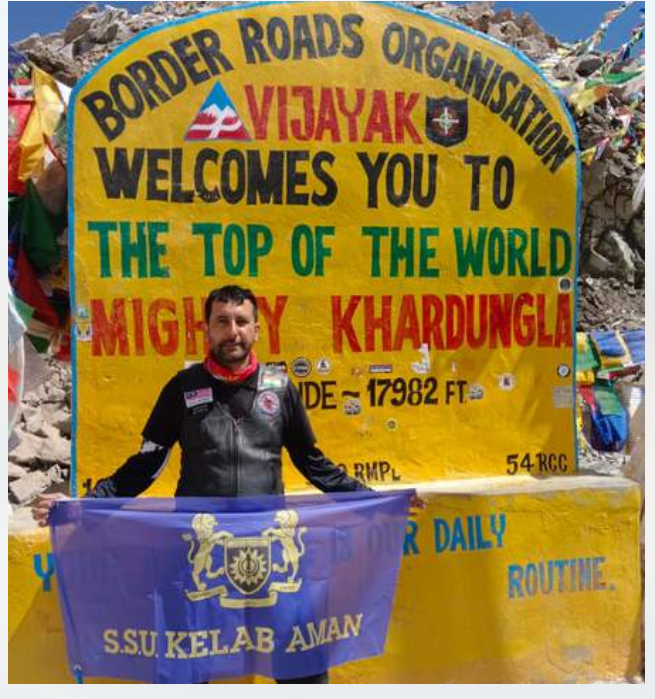
The 11-day journey was packed with excitement and adventure, taking the team through some of India's most breathtaking landscapes.