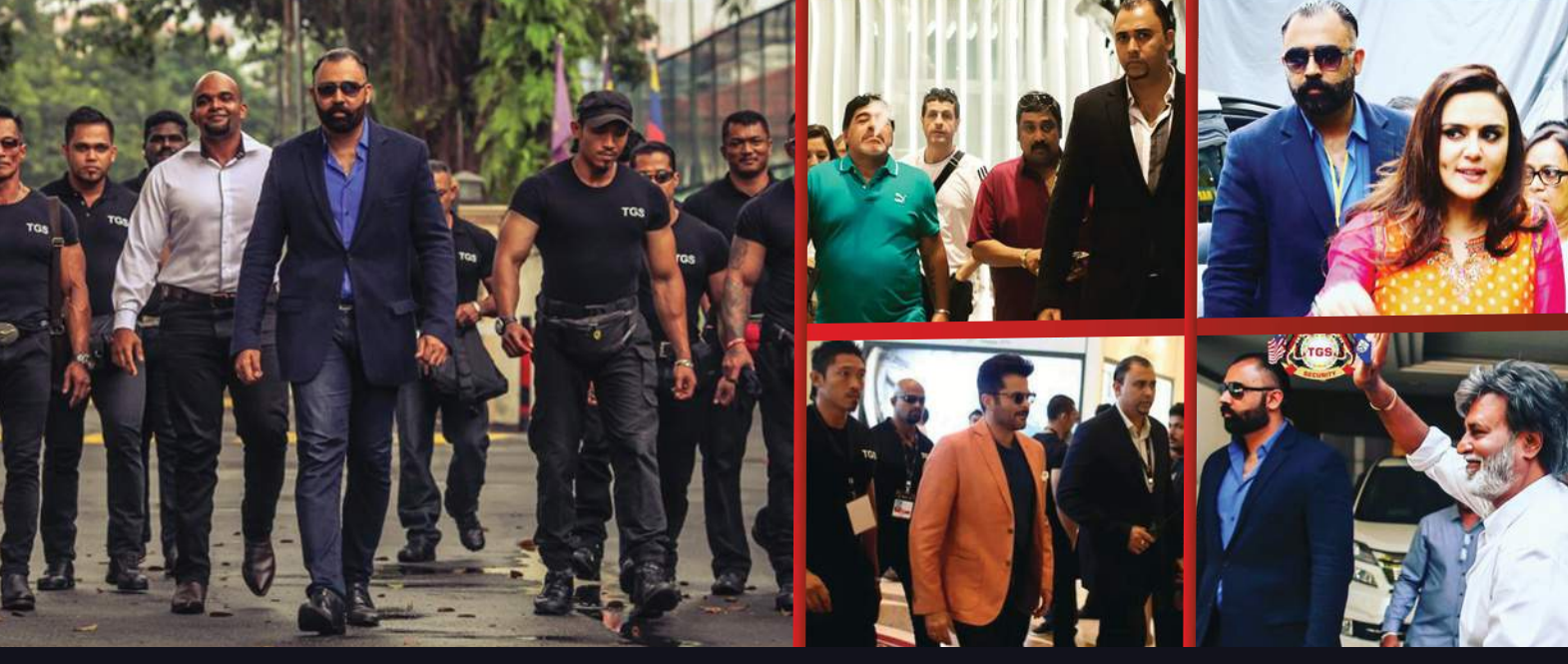
TGS Professional Team Provides Trained, Experienced & Certified Armed / Unarmed Local / Nepal Guards Specialized in Bodyguarding, VVIP Protection, Special Events, Hotels, Resorts, Residential (Gated & Guarded), Shopping Malls, Medical Centers, Educational Institutions & Premises of Public Listed Companies.